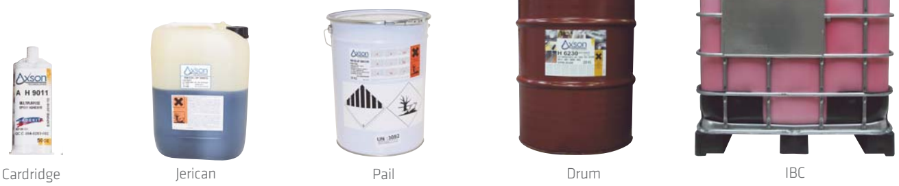
Cartridge Jerican Pail Drum IBC

Several standard packaging are available depending on the recommended processing way from cartridges to large bulks. Final choice is a compromise between economical, productivity and overall quality performances.